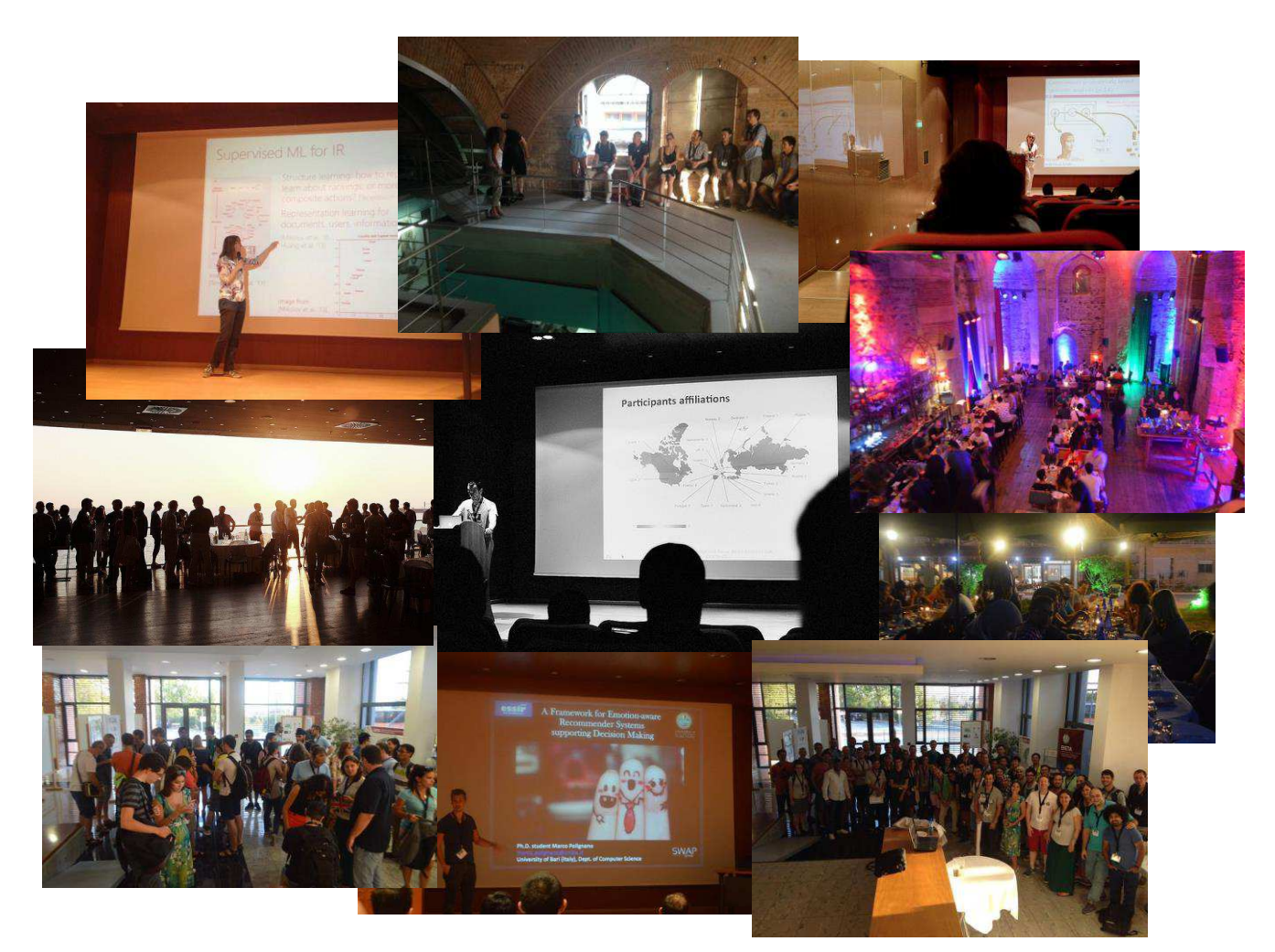
Figure 4: ESSIR 2015 moments.

The questionnaire also allowed ESSIR 2015 attendees to provide their recommendations. One point that came up a couple of times was that students would also appreciate some hands-on sessions where they would be made familiar and gain practical experience on the material taught and IR tools introduced during the lecturers. They consider that this would be particularly useful given that most of the participants were first-year PhD students and this would allow them to benefit from the guidance and experience of senior IR researchers. This desire for more practical activities was also reflected in other recommendations that indicated that they would be interested in spending more time in group activities.