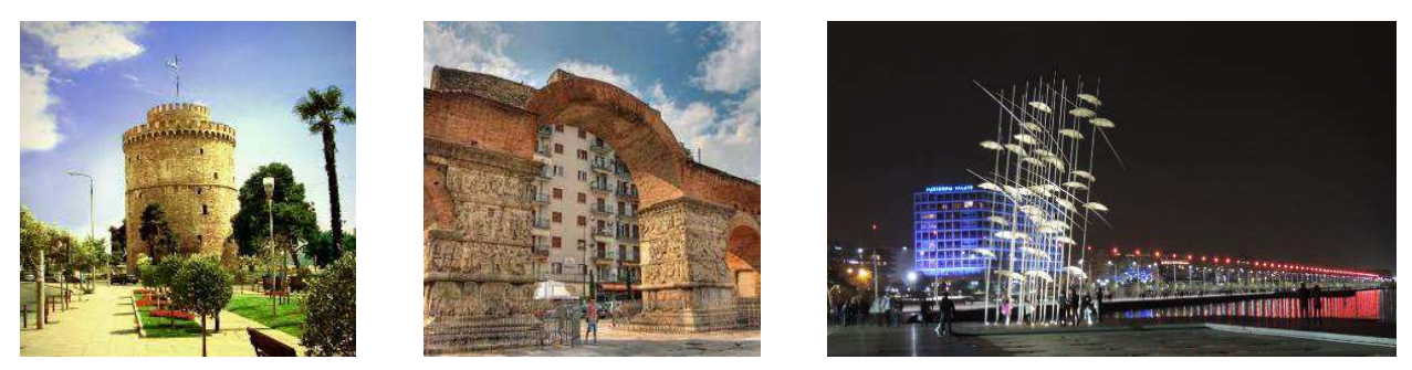
Figure 1: The White Tower (left), the Arch of Triumph of Galerius (center), and the Promenade (right).

fact, many of its Byzantine churches and also a whole district of the city are included in UNESCO's World Heritage list. A few of the key sights that attract many of the city's visitors include the White Tower, the Arch of Triumph of Galerius, the 10km long seafront promenade (Figure 1), the Byzantine citadel, the Roman Forum excavations, the Byzantine churches of Agios Demetrios and Agia Sophia, the Turkish public baths of Bey Hamam and Bezesteni, and the Jewish museum. Thessaloniki is also considered to be the culinary capital of Greece, featuring hundreds of restaurants and food spots, covering a wide range of styles, cuisines, and size.